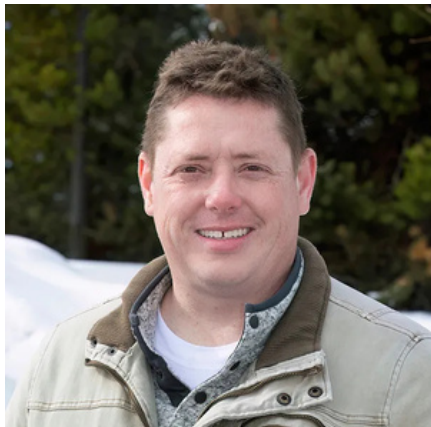
Mayor Jeff McBirnie